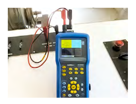
Here, channel 1 of the Handscope<sup>®</sup> is connected to the inductor via the BNC/Banana adapter.

If the inductor voltage tends towards zero and a voltage is present in the armature, the speed will tend towards infinity, from a theoretical point of view. In practice, this phenomenon could damage the motor.